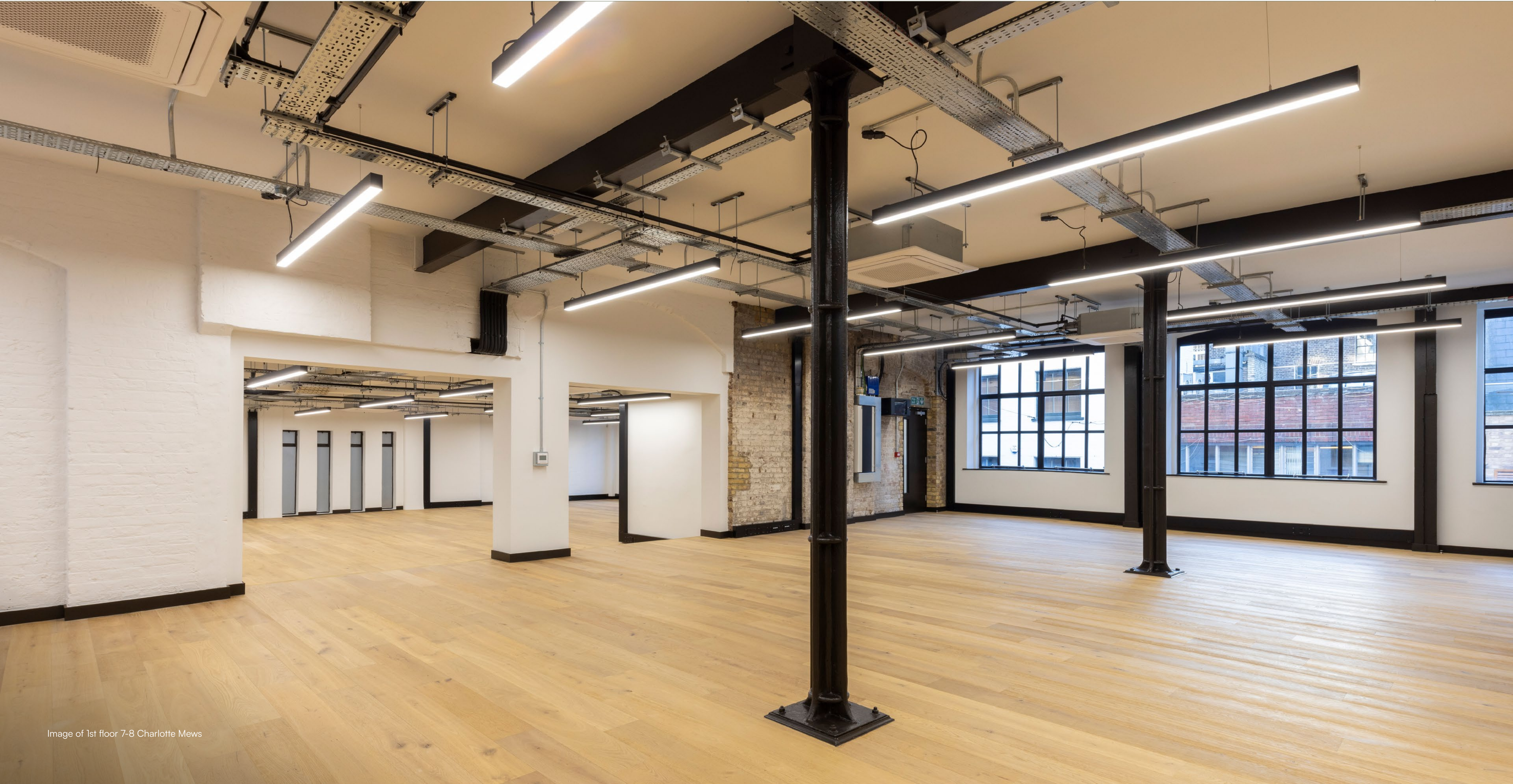
Image of 1st floor 7-8 Charlotte Mews