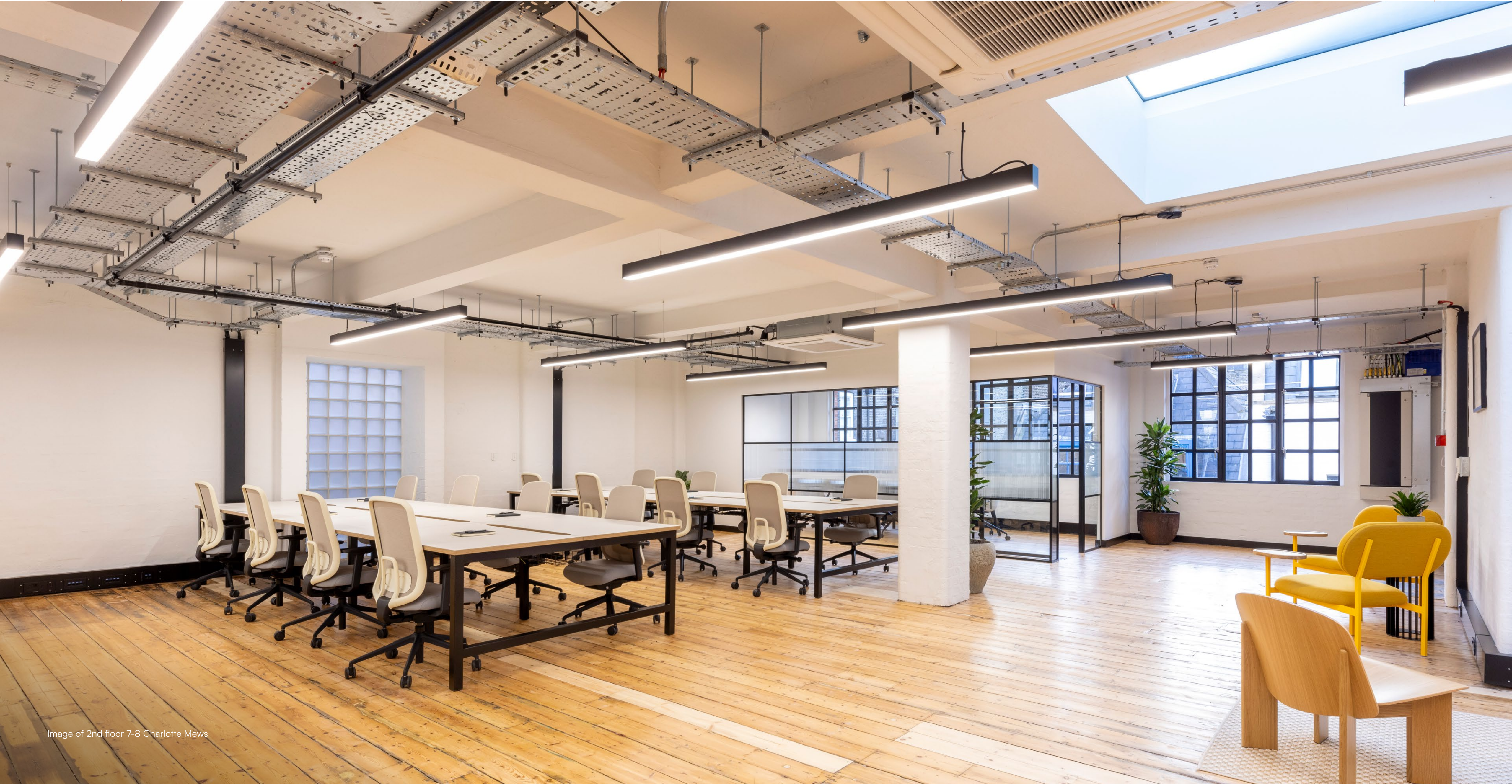
Image of 2nd floor 7-8 Charlotte Mews