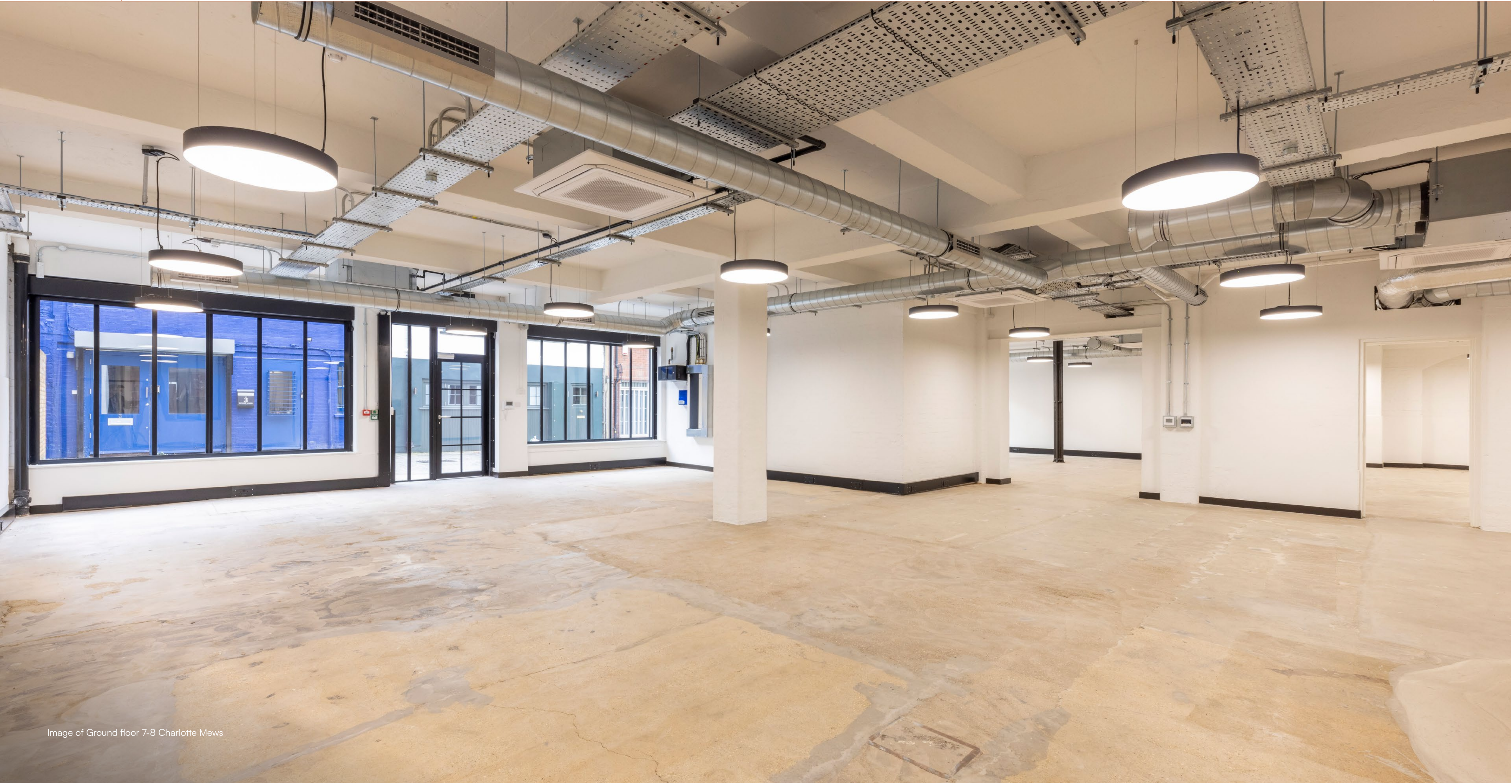
Image of Ground floor 7-8 Charlotte Mews