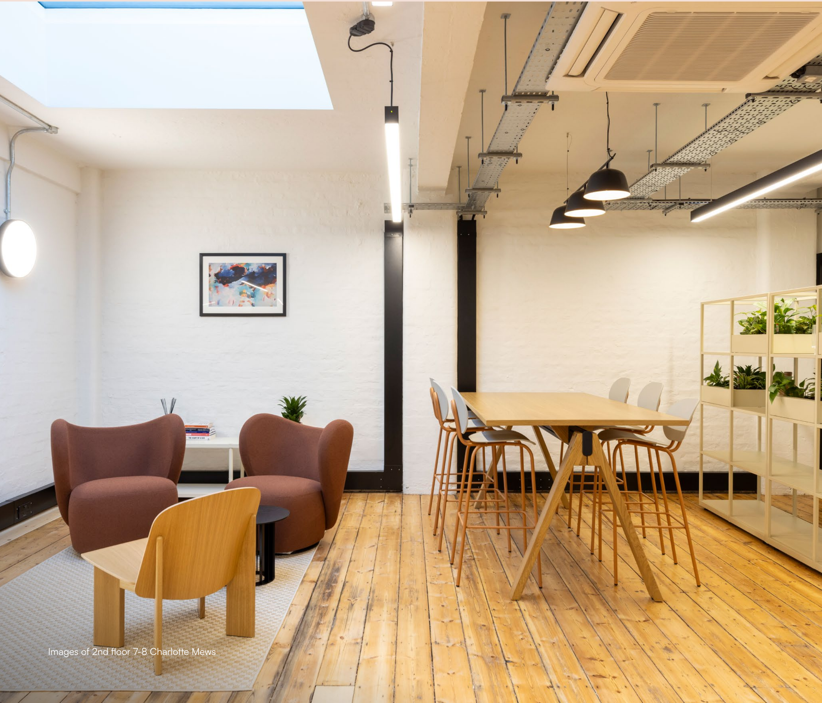
Images of 2nd floor 7-8 Charlotte Mews